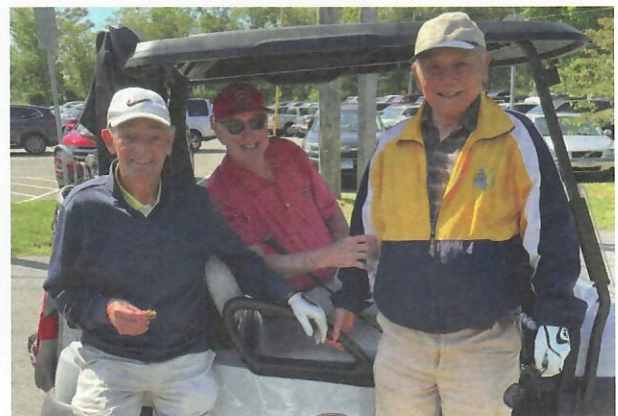
Friendship Through Fitness