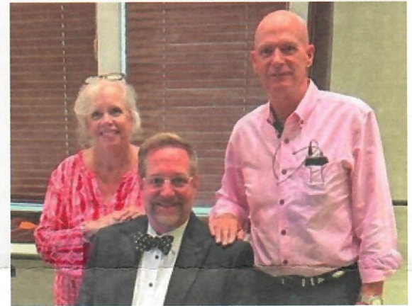
Tea Party Celebrating Maria Callas