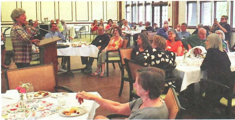
Volunteer Appreciation Reception