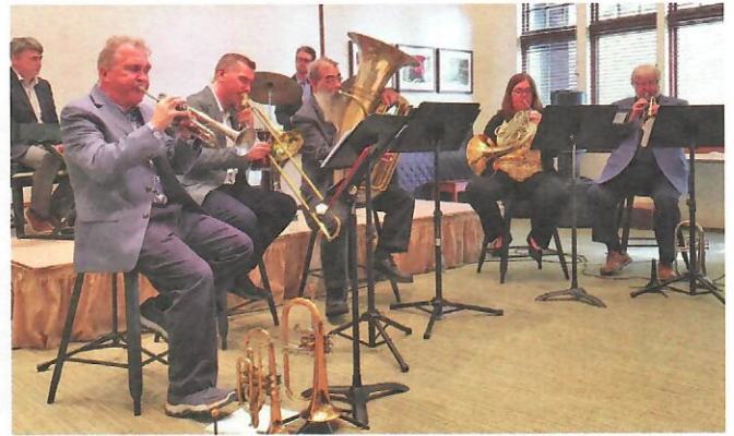
Gramercy Brass Orchestra of NY