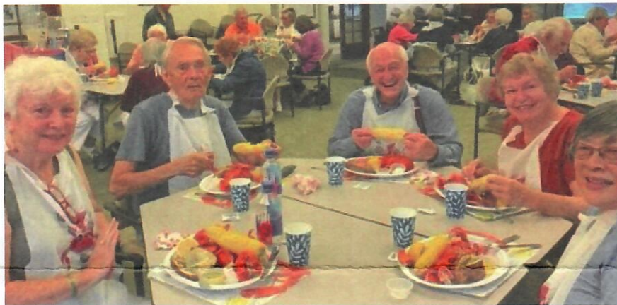
Lobster & Clam Bake