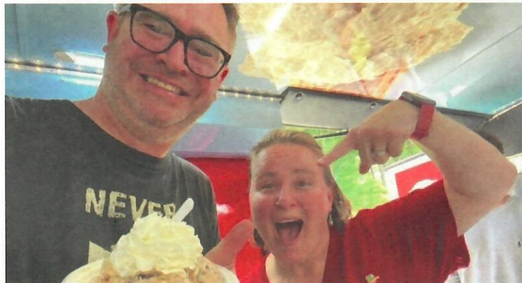
National Ice Cream Day Celebration